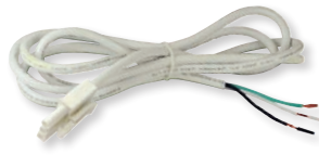
72" 3-Wire Hardwire Connector

NUA-803 White Used to join two NUDTW-88 fixtures seamlessly together. One connector is included with each luminaire