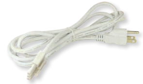
72" Cord and Plug

NUA-804B Black NUA-804W White Used to hardwire NUDTW-88 fixtures to NUA-802 or junction box (by others)